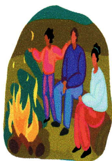
Ng like a campfire to bring friends together.

10 Motor Cities Winnies coaches made the trek across the state to participate in this years State Rally. Many arrived early on Thursday to get set up and to enjoy the beautiful